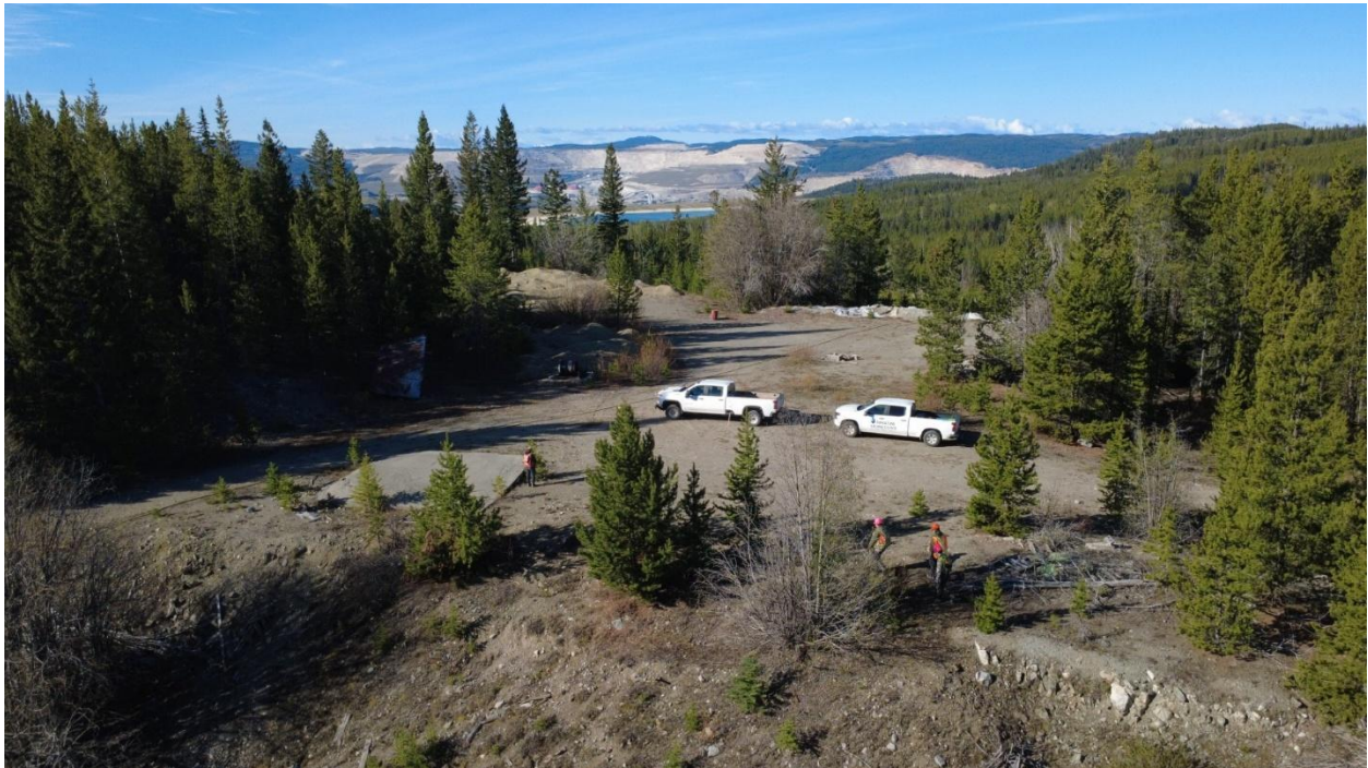
Image 1: Field crews at Getty South with the historic Trojan Mine (entrance capped, concrete pad at center left) and Teck Resources’ Highland Valley Copper Mine in the background.

The Trojan Zone will be the initial target of the planned drill program at Getty South. Planned drill holes ranging from 150 to 500 metres are designed to determine the geometry, grade, and mineralogy of extensions to the near-surface high-grade zones, while also testing geophysical anomalies located down-plunge of the high-grade breccia zones.